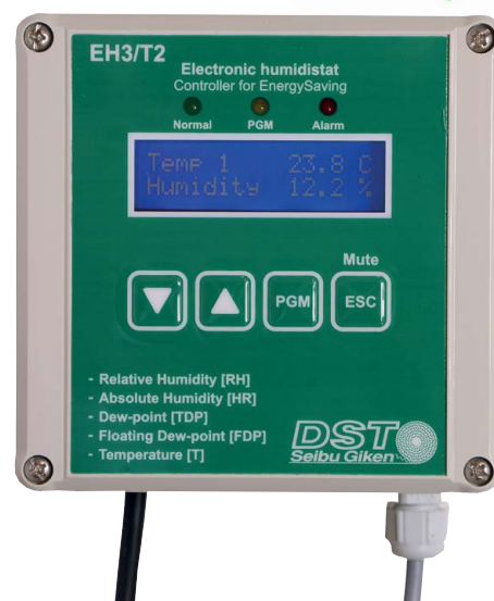
EH-3 T2 with back-lit display, available from Seibu Giken DST only.

Sensor: Capacitive type moisture sensor from Honeywell with an accuracy of \pm 2\%RH and \pm 0.5^\circ C . Each sensor comes with a calibration protocol.