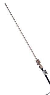
Immersion sensor. (optional), also available for surface mounting