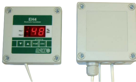
DISPLAY: RJ9 cable low voltage Standard 25 m. Optional extension kit, (200 metres max).

Option: External display. Display and key set via a 25 m low voltage cable.