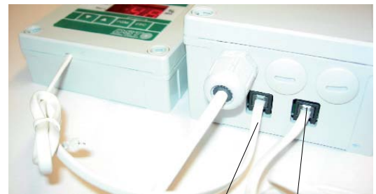
Display cable Sensor cable

25 meters low voltage cable to display from relay box. 230 V supply to relay box. 3 meter sensor cable from relay box.