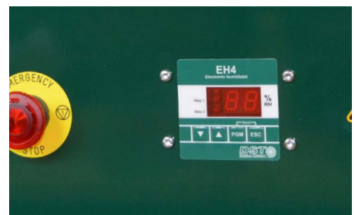
Panel-mounted EH4 in RL-71R.