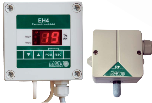
EH4 and standard room sensor IP65. Room sensor: low voltage 3 m. Optional 25 meters RJ9 extension cable (50 meters maximum)

Sensor: Honeywell fast response capacitive type moisture sensor. Factory calibrated (accuracy < \pm 2\% RH). Optional: available for wall or duct mounting.